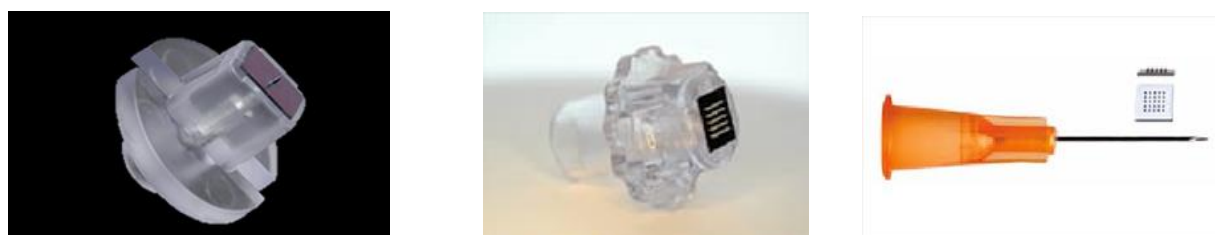
Different DebioJect™ configurations and comparison with conventional needle.

DebioJect™ is protected by over 7 patent families, pending and/or granted.